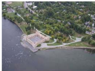
Fort's St Louis & Chambly at Chambly, Quebec