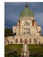
St Joseph Oratory Montreal, Quebec