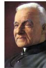
Blessed Brother Andre Bessette