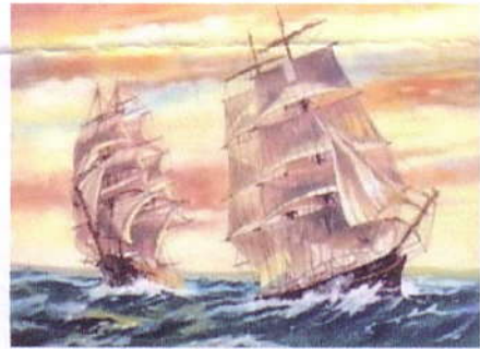
Arrived in Quebec on Sept. 14, 1665 Aboard the ship “La Justice”